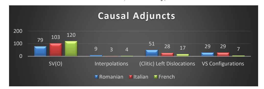
Figure 2 : Distribution of the investigated phenomena in the ROAMED corpus

As concerns the temporal adjuncts, the Figure illustrates the fact that most of the extracted subordinate clauses follow the canonical SV(O) word order of the constituents, but there are also many structures in which the prototypical order is slightly affected or even highly modified. It should be noted that not all the extracted adjuncts were registered in this Figure, as I decided to leave aside the temporal or causal adjuncts in which the connector is followed by an infinitive and the adjuncts with the non-overt subject. This feature, also known as 'null pronominal subject' is specific to the so-called 'pro-drop languages, such as Romanian and Italian. Unlike FTAs, in which subject realization is obligatory (as French is not a pro-drop language), almost a half of the extracted RTAs, and many ITAs have this type of subject or have no subject at all. Among the Romance languages, Romanian belongs to the same group as Italian, Spanish, and Portuguese, but it is different from standard French, where we can find an expletive clitic il (Renzi & Andreose, 2003, p. 217; Reinheimer & Tasmowski, 2005, pp. 105-106; Metzeltin, 2011, p. 84) or a generic pronoun on in subject position (Pană Dindelegan & Maiden, 2013, p. 108). Figures 1 and 2 indicate that, on the one hand, the SV(O) configuration is prototypical for the temporal and causal adjuncts