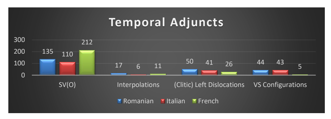
Figure 1 : Distribution of the investigated phenomena in the ROAMED corpus