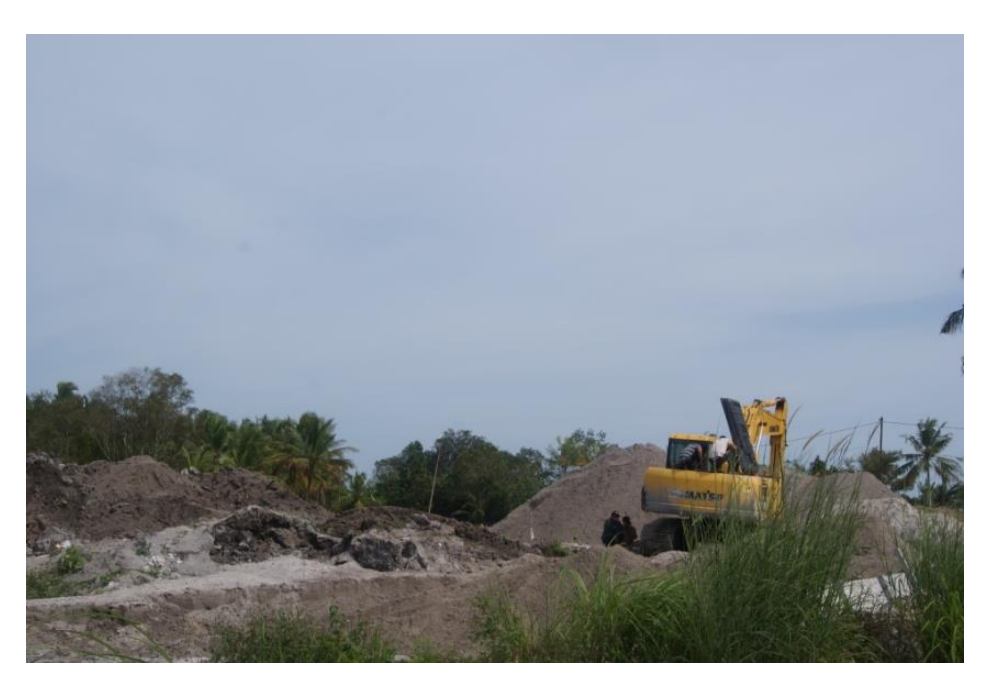
Figure 1: Mining Expansion in the Area Around Plantation

This condition caused the farmers who were previously plantation tiller patiently turned to be the victims. The author understood that farmers would in turn be in trapped by the temptation of high income; however, in short term vision. People's economy experienced shock when mining activities were not active anymore and at the same time, the plantation land had been ruined and difficult to rehabilitate.