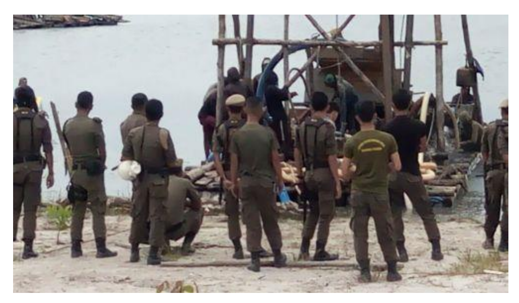
Figure 7: In conventional Mining Control in Bangka Tengah Regency