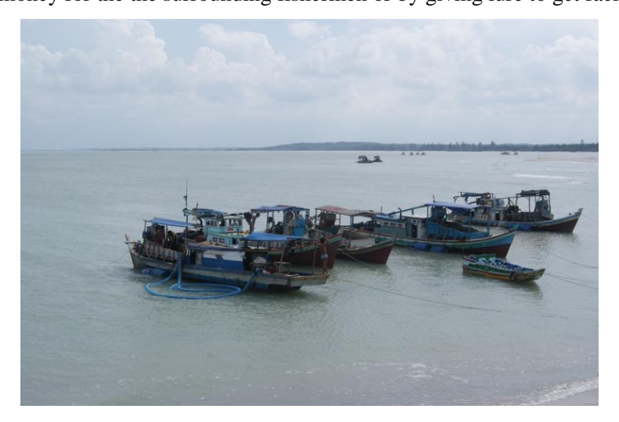
Figure 2: Fishermen's Ships Mingling with 'Apung' Unconventional Mining

The fishermen's disappointment record often ended with demonstration, reserve, hijacking, or burning. However, tin exploration ambition has defeated rasionality. The prove is that the businessmen never lose their mind to make approache, either by giving concessionary concession in money for the the surrounding fishermen or by giving lure to get facilities.