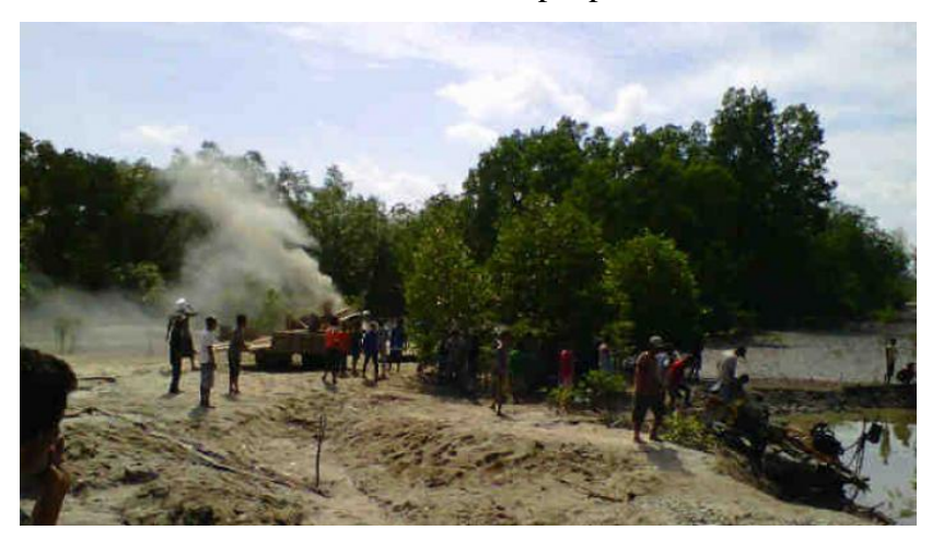
Figure 5: Unconventional Mining Equipment was burnt by People

It was basically come up because there was an interest gap. According Hutapea, et al. (2017), non-seriously managed natural resources exploitation would result in violence. In this case, all parties having conflict tended not to be able to overcome that gap, for example, as it was based on social jealousy, land seizure, the dcreased income of local people, or because of the changing value and culture between new comers and local people.