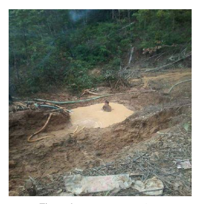
Figure 6: Mining in Forest Area