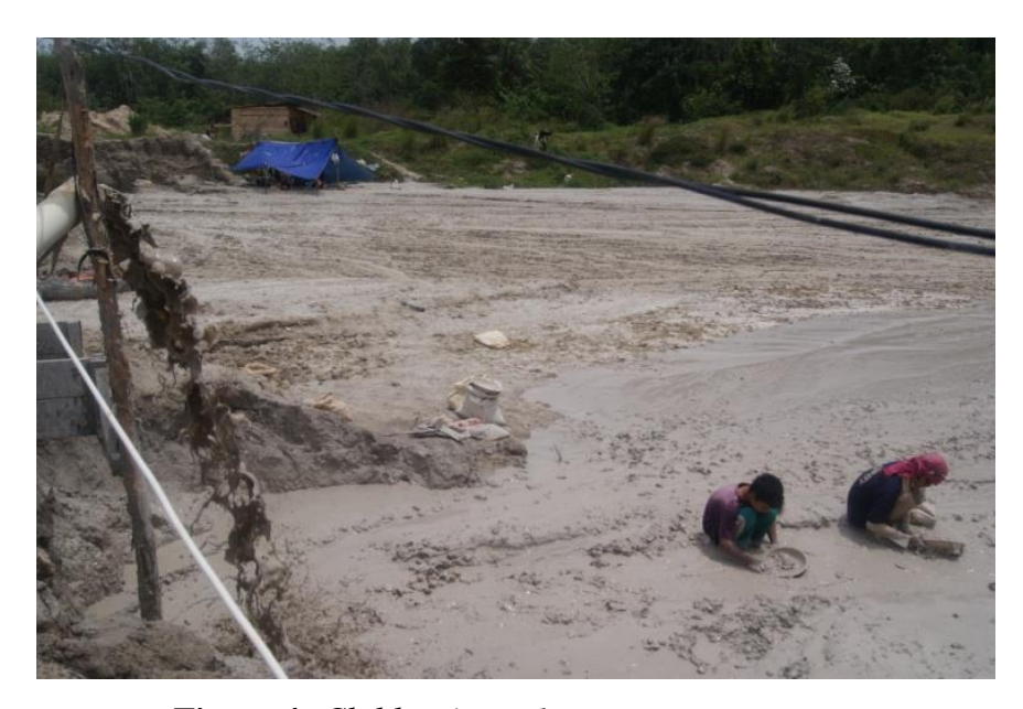
Figure 4: Children's Exploitation in Tin Mining

from local government; therefore, parents apparently do not have burden when their children must quit from their school.