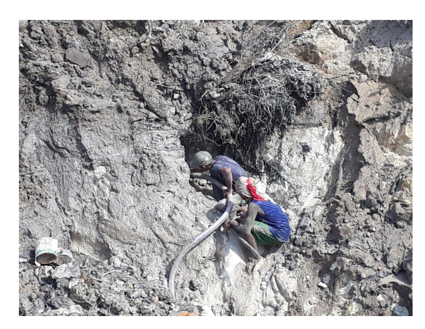
Figure 8: The Mining in South Bangka, A Risky Job