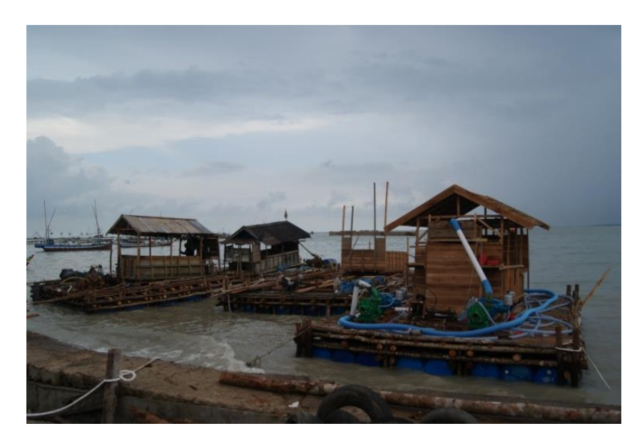
Figure 3: Apung Mining in the Coastal Area that Destroy the Beach Beauty