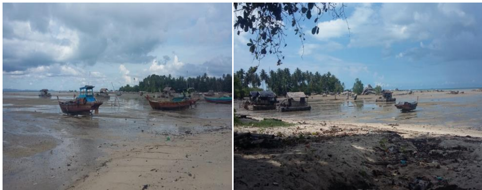
Figure 3: The Picture of Teluk Limau Area

The following picture explains the compromising life atmosphere: