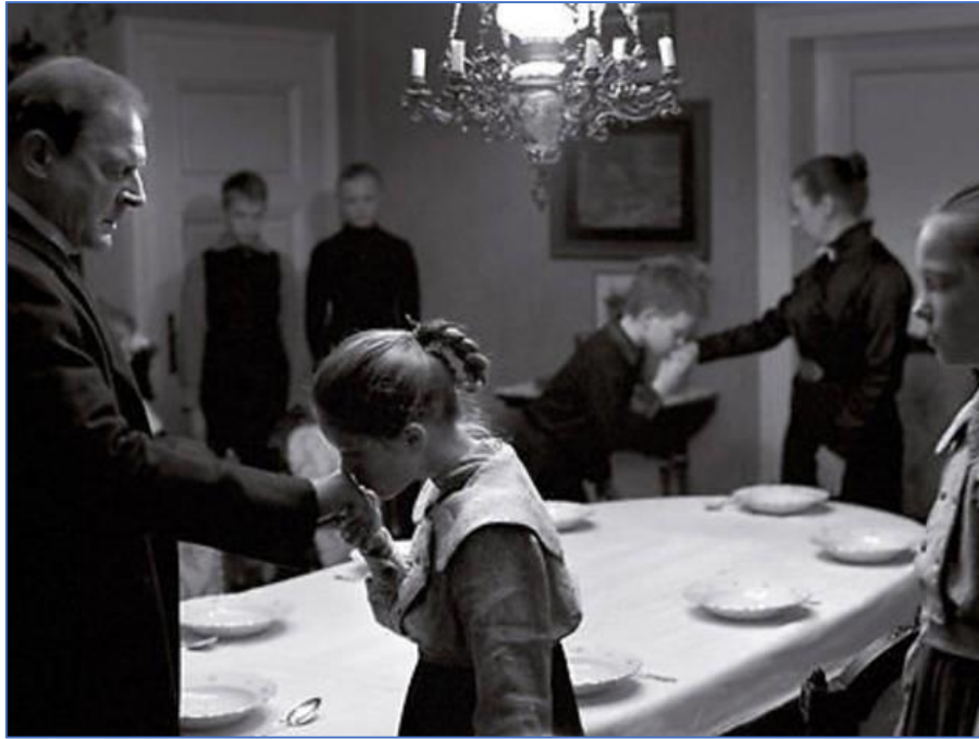
Figure 4: Just before Bedtime in Pastor's family (The Guardian)