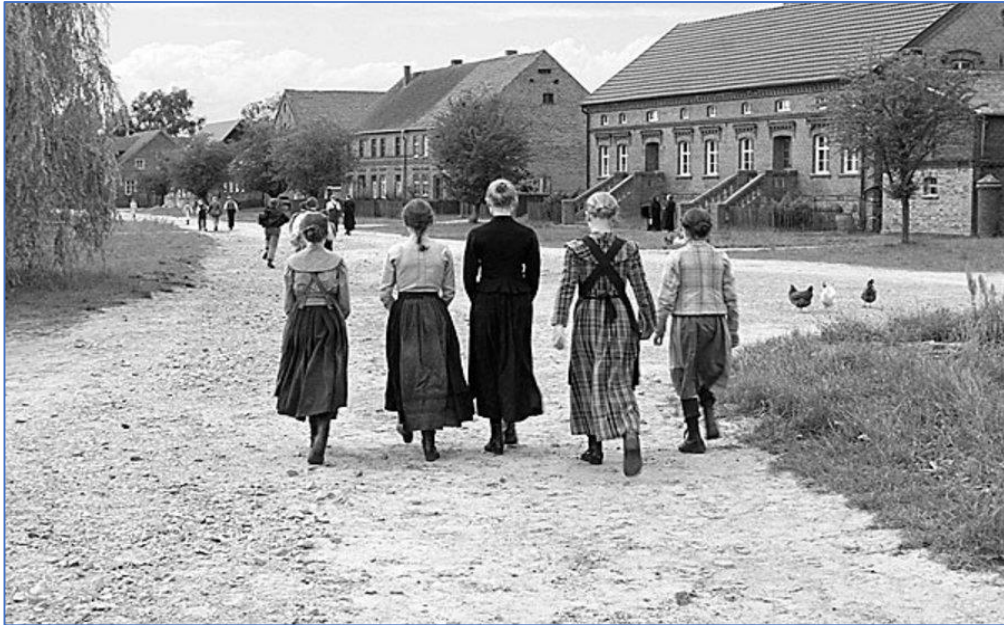
Figure 2: Haneke's children in "The White Ribbon"

A significant change is the refreshing simplicity of this movie. Although the plot revolves around uncovering the mystery – unlike Haneke's earlier films – the viewer almost always knows exactly what is happening in each scene, who the different characters are and how they are related (despite the large cast in the film). When it comes to technology: close-ups dominate, while shots from a moving camera are very rare. Long shots are also occasional.