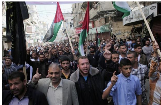
Figure 2: Palestinians are uniting for a General Strike