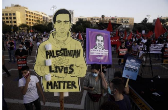
Figure 3: Protesters Attend a Rally Against Israel Plans to Annex Parts of The West Bank in Tel Aviv