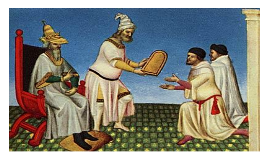
Figure 1: Kublai Khan Presents Golden Seal to Polo