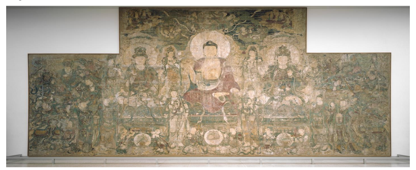
Figure 2: Buddha of Medicine Bhaishajyaguru (Yaoshi fo), 1319

Medicine Bhaishajyaguru (Yaoshi fo 藥師佛)" is a mural built during the Yuan Dynasty and has a height of 751.8cm and a width of 1511.3cm.