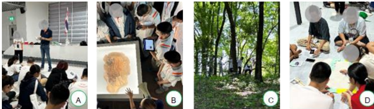
Figure 2. The process of PMAG in part 1-3

The pedagogy process of this study will start with all of participants enrolled in the ESC416 course. After that, the processes were divided to 4 part which were presented in figure 2-3.