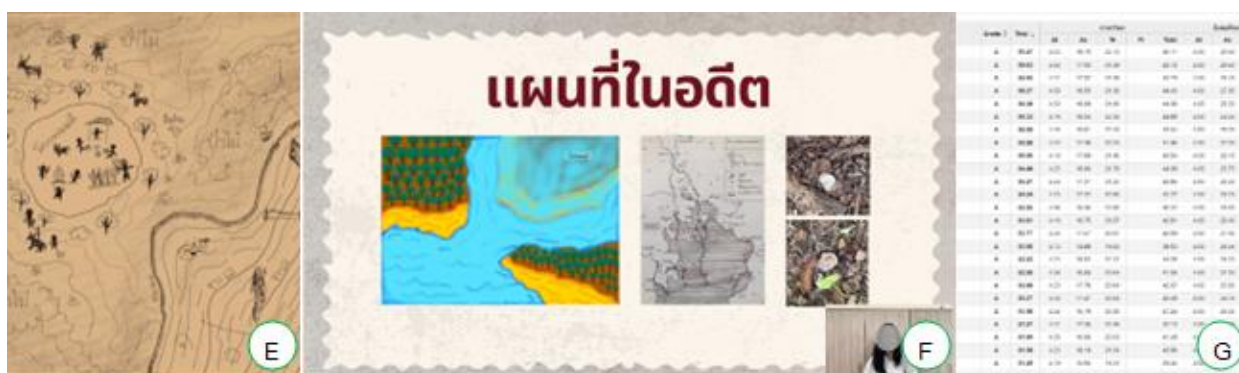
Figure 3. The process of PMAG in part 3-4