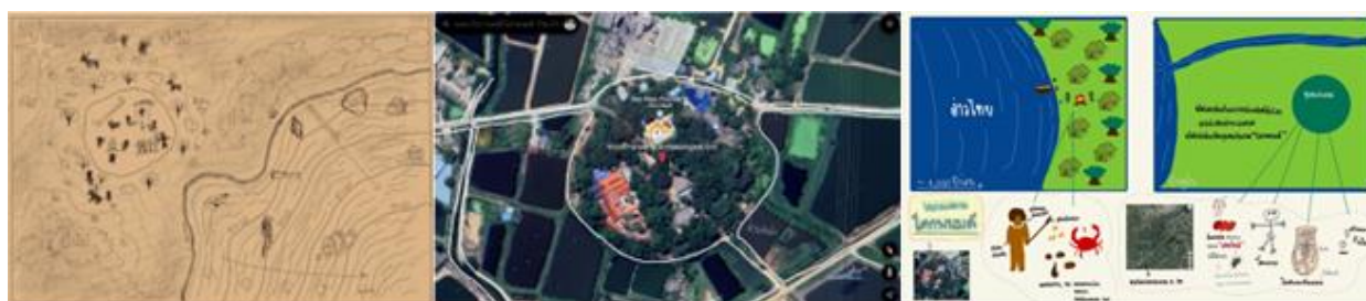
Figure 4. An ancient human settlement map from some student group