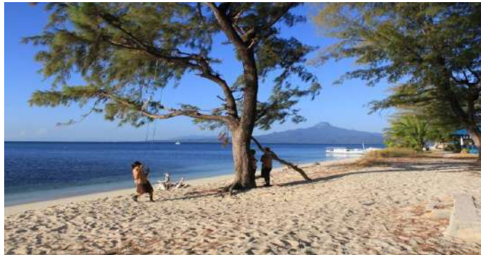
Figure 3: Sagori View Point

Based on the overall evaluative elements of the attractiveness of tourism objects, the total score is 750. This score was compared to the classification of the development of natural tourism objects.