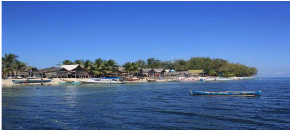
Figure 1: Sagori Island

This research was conducted in January to October 2015 and it was conducted in Sagori Island, Kabana Barat Sub-Regency, Kabana Regency and other locations which have any connections with Sagori Island.