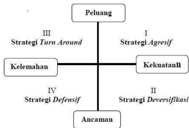
Figure 2: Matrix Grand Strategy Adapted from (Rangkuty, 2000)

SWOT analysis was conducted to determine the external and internal factors of Sagori Island. These factors were required to define the proper strategy used to develop Sagori Island as English Camp-based tourism village. The scoring or the weighting is done to get the position of the development strategy of the tourism of Sagori Island on the diagram SWOT analysis. SWOT diagrams can be seen in Matrix Grand Strategy in Figure 2.