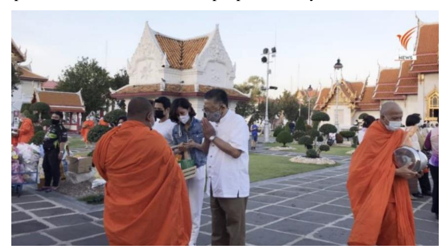
Illustration 7: People Make Merit and Give Alms to The New Year