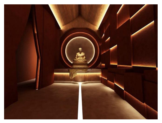
Illustration 8: Room of Meditation

to Buddhist scriptures, generating aesthetics in viewing and becoming valuable collector's items.