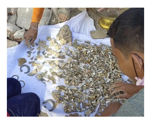
Illustration 4: A Group of People Working on Amulets