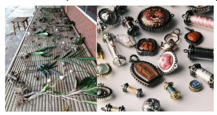
Illustration 6: Wan Auspicious Powder, Charm, Great Popularity, Invulnerable

The use of amulets and talismans to call for heaven's protection and to increase ability at birth or to increase an opportunity to fulfill one's need seems not to be restricted by time or culture. Amulet art has a variety of patterns and nature starting from materials found or the assembly of materials until documents are finely made including graphic components and numbers. These characteristics seem to be determined by culture. It was found that some amulets and talismans were the uniqueness of one culture or civilization while other groups may closely involve and broken down into amulet components, symbols, raw materials, ingredients, energy, confidence in living, or even substances. In addition, underdetermined culture, the patterns of amulet art including content may change over time due to internal and external influences, social situations, or new society that may require new patterns of new ideas of protection to be consistent with the current way of life.