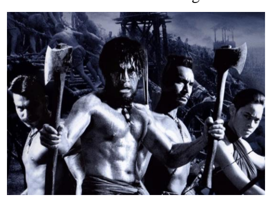
Illustration 5: Set Right Before the Fall of Thailand's Old Capital, Ayuttaya, Bang Rajan Draws on The Legend of a Village of Fighters Who Bravely Fended Off the Burmese Armies

method to ensure they achieved the majestic power of the Buddha. According to studying the research on votive tablets in the troops in the Ayutthaya period (Thampitak, 2012), it was found that after the Ayutthaya Kingdom wasdestroyed the making of votive tablets having majestic power of the Buddha started as talismans used to give morale among the troops and people. Buddhism in the Ayutthaya period did not stresson Dhamma for the cessation of suffering but the belief from Khmer Mahayana Buddhism was brought to combine with Brahmans who performed Buddhabhisek ritual to make votive tablets tobe talismans to protect people from danger and to become spiritual anchors. Votive tablets and talismans made during wartime were stored in pagodas after the war ended to dedicate merit to persons who were dead in war or were kept in pots and buried under Ubosot or Viharn. Some scholars gave opinions that at that time people did not bring votive tablets into their houses. They were more likely to bury them in temples until treasure troves were destroyed or villagers found them accidentally. Votive tablets found were named after, such as Phra Nang Phaya from the Wat Nang Phaya treasure trove, and Phra Khun Paen from the Ban Krang treasure trove (Thambandan, 2015).