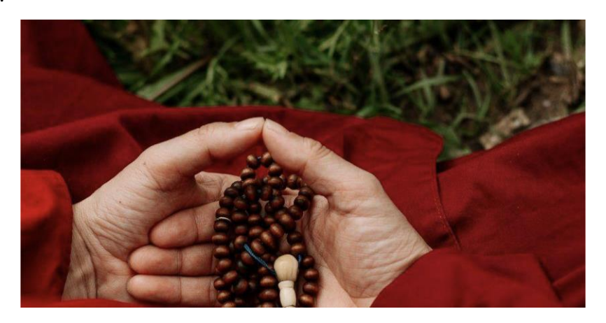
Illustration 2: How to Use Buddhist Prayer Beads

The religious duty of Buddhist people has not been decreased, indicating the importance that people can wear any kind of amulets or talismans to show their respect while they are protected at the same time.