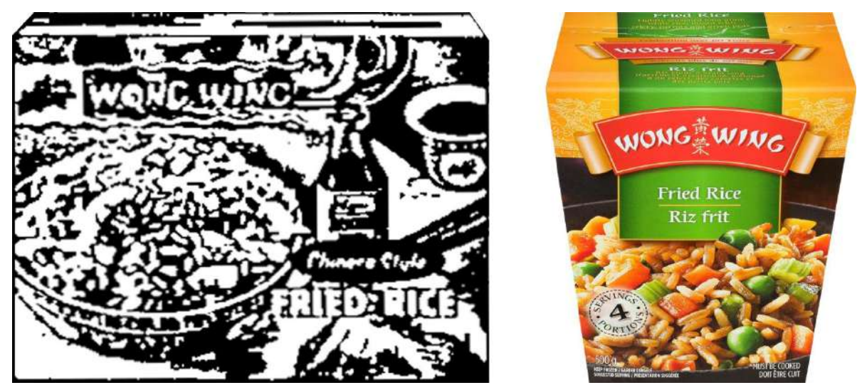
Figure 3: Iterations of Wong Wing Fried Rice Pre-and Post-Acquisition (Left to Right)