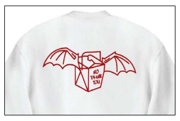
Figure 8: Recreation of California Artist Jess Sluder's "Bat Fried Rice" T-Shirt