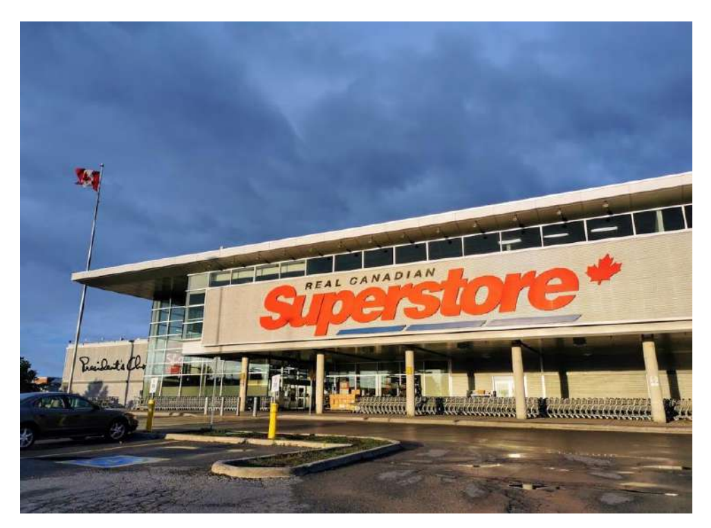
Figure 2: Real Canadian Superstore Located at 1755 Brimley Rd, Scarborough, Toronto, (Source: Real Canadian Superstore Brimley Road, by C. Shaowei, 2020, Google (<u>https://goo.gl/maps/BeeZsY4b8Yx8gBYx5</u>). Copyright © 2020 Chen Shaowei.)