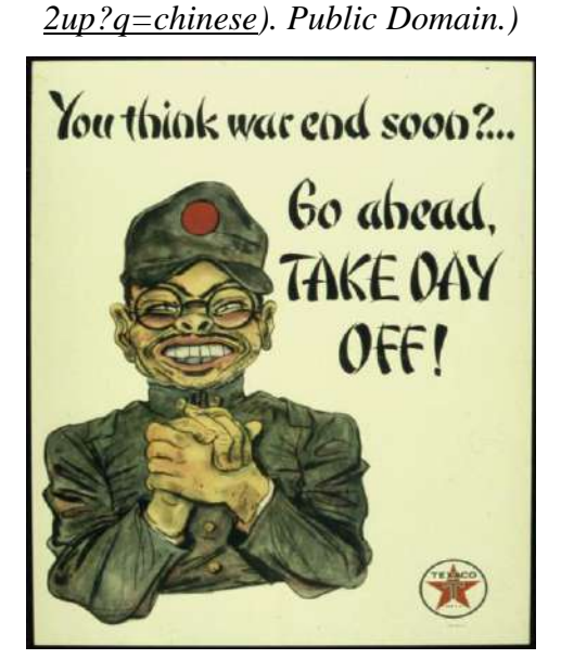
Figure 6: Anti-Japanese Propaganda Poster Sponsored by Texaco, Inc Which Circulated During World War II