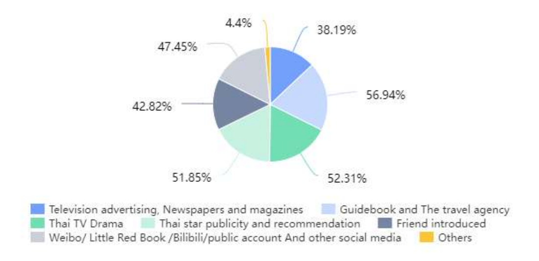
Figure 2: Access to Thailand Travel Information

In this survey, 53.47% of people wanted to travel to Thailand to be "close to their favorite Thai star/idol", indicating that apart from a desire to leave daily worries and be relaxed, the Thai superstar factor is gradually becoming a greater internal driver for Fans to travel.