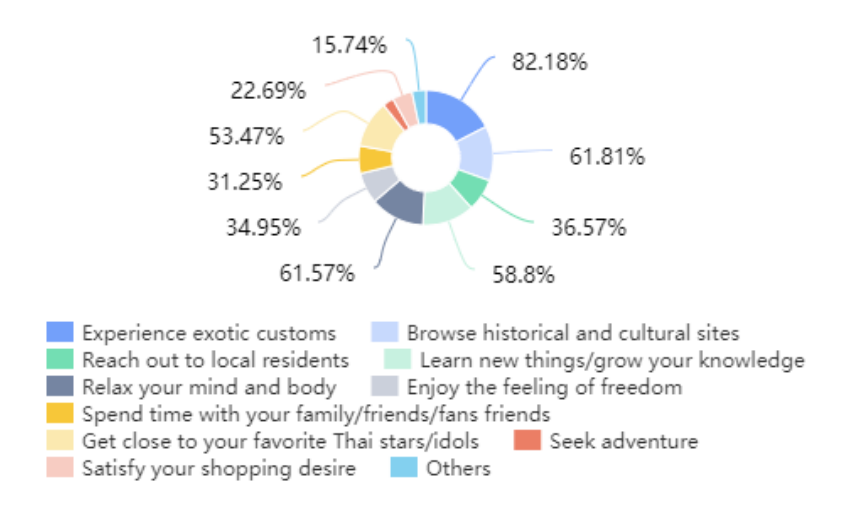
Figure 1: Travel Motivations