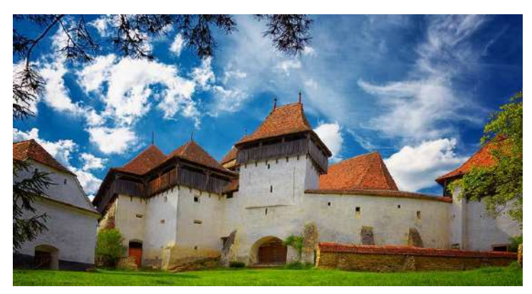
Figure 1: The Fortified Church - Viscri Village

The cultural heritage of the village includes the Fortified Evangelical Church, the architecture of the village houses, as well as the customs and traditions of the locals. Both the village and the fortified church in Viscri are included in the UNESCO heritage list, and this has contributed to the attraction of tourists in the area. The locals have set up a museum with popular objects and costumes where tourists are told about the history, traditions and culture of the village.