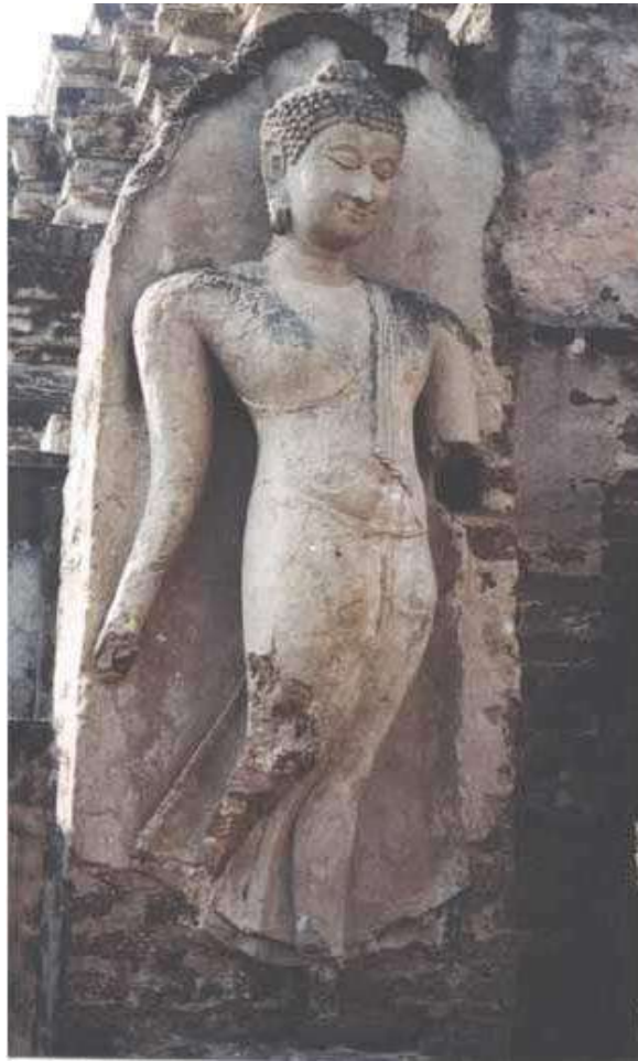
Figure 5: The image of the Buddha, Sukhothai, 13 th –14 th centuries, Wat Rattana Mahatat

Sukhothai state is believed to be a first Thai kingdom appeared between the 13 th and 15 th centuries. The word Sukhothai means "Dawn of Happiness" which probably represents a "new state" or a "new place" located in a mountainous landscape and a sacred place. Prince Dhamrong Rajanupab says in his book, Boran Kadee (The Archaeology) that the Sukhothai image of the Buddha is designed to show a delicate sense of motion. He confidently believes that it is a kind of a revolution in Thai art. In short, the image of the Buddha was built in the middle of 14 th centuries, is believed to represent the King Ramkamhaeng, the powerful king of Sukhothai kingdom. As seen in my previous article ' The Sukhothai Image of the Buddha: the characteristics and the classification of its idealistic art form, ' I have pinpointed that the image of the Sukhothai Buddha is very magnificent. Its characteristics represent the peaceful time of