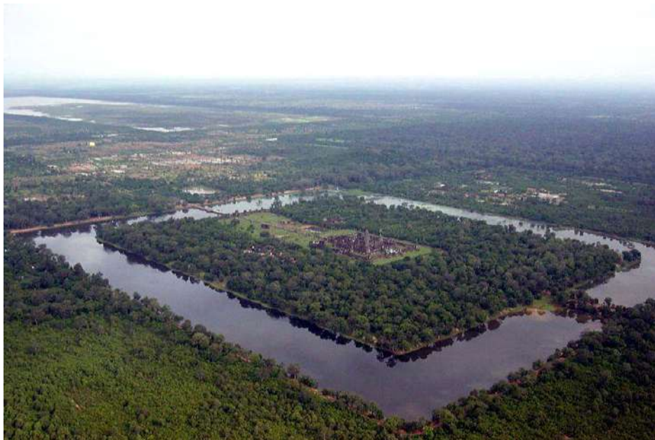
Figure 4: Angkor Wat, symbolizing Meru Mountain

After the period of the King Jayavarman II, the power of HariHara came to an end and transformed into Angkor Wat. The central aspect of the rule and the representation of the ' god-king' are almost the same. Angkor Wat is the largest of the Khmer temples and was dedicated to Visnu and built by King Suryavarman II in the early 12th century. Not only the construction of the mythic temple; the five towers symbolizing Meru Mountain, the enclosing doors representing the edge of the world, and the surrounding moats representing the ocean, signifies the ' sacred place,' but also, its design of building the temple relating to the King is 'sacred.' Angkor Wat is unlike any other temple in the Khmer Empire and is remarkable for its functional construction. The 'sacred' ritual of processing from the western entrance can be linked to the meaning of the King's name, Suryavarman. In his book, The History of Cambodia , David Chandler writes that '