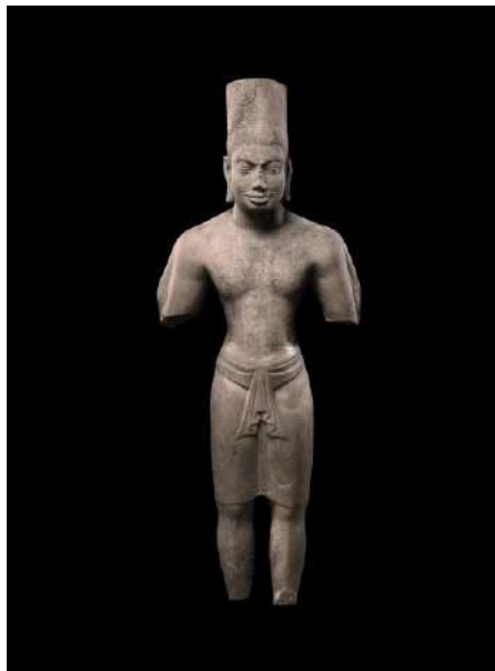
Figure 3: Harihara, Sandstone, Sculpture, late 7 th -8 th Century https://www.metmuseum.org/art/collection/search/38162

In the Angkorean period, it is true to say that we are unable to escape the framework of the monarchy and society. Many important cities were built down the century under the power of the king and his people. Interestingly, the city shows a supremely strong sense of belief in the relationship between god and the king. The city of HariHara was built in the 9 th century, and this extraordinary temple of Preah Ko is a great temple represents the 'foundation as of Angkor.' It