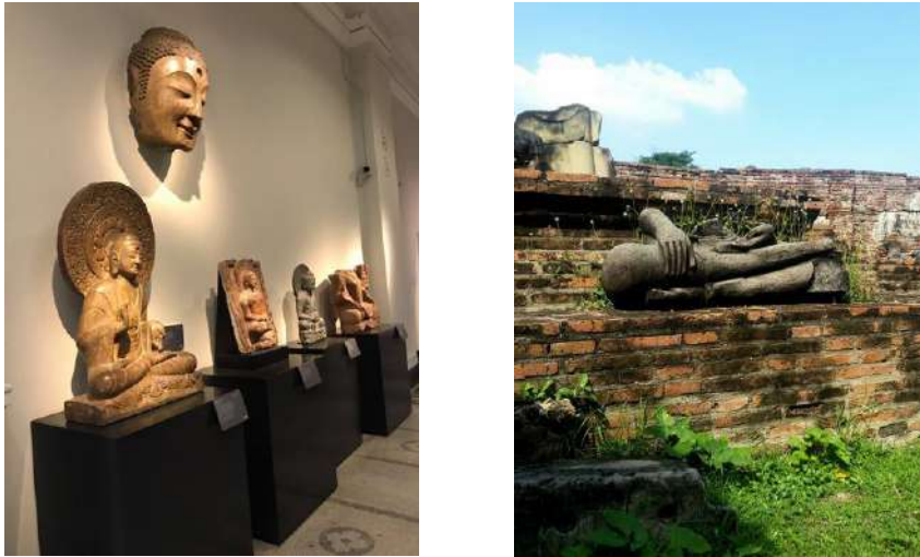
Figure 1: Comparison the image of the Buddha in museum and at site

In Thailand, from a museum database (20th July 2017), there are 1,457 museums across the country. Museums have divided into two types; one is a general museum, and another is an online museum. The report explains that there are about 1,453 general museums and only four online museums which all have registered in a museum database. However, we currently notice that the number of museums in operation is slightly adjusted which can see from numbers below;