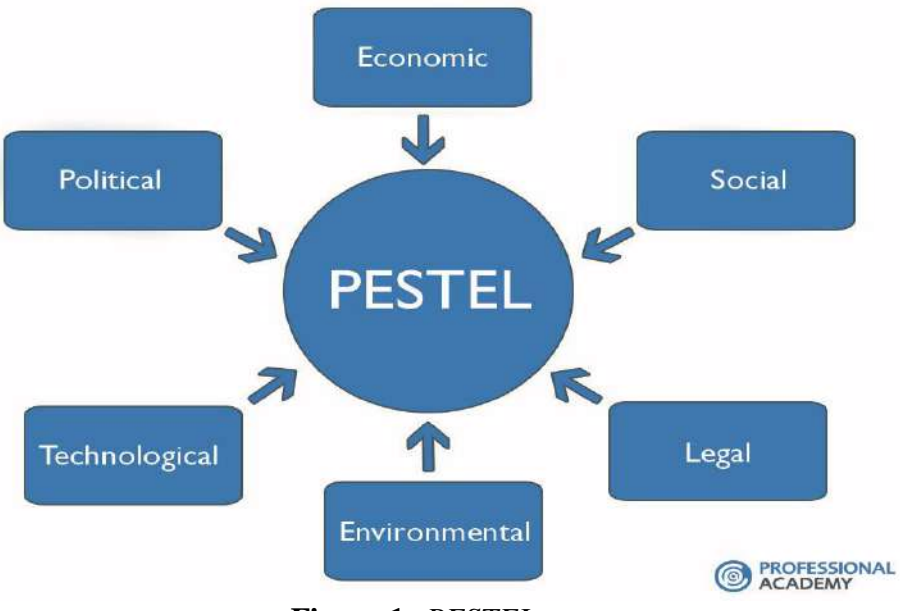
Figure 1: PESTEL

The methodology was obtained in this study, including previous offline library research papers, and previous online studies from academic articles and literature reviews on the subject of globalization Malaysian SMEs and challenges regardless of operational, financial, and managerial aspects.