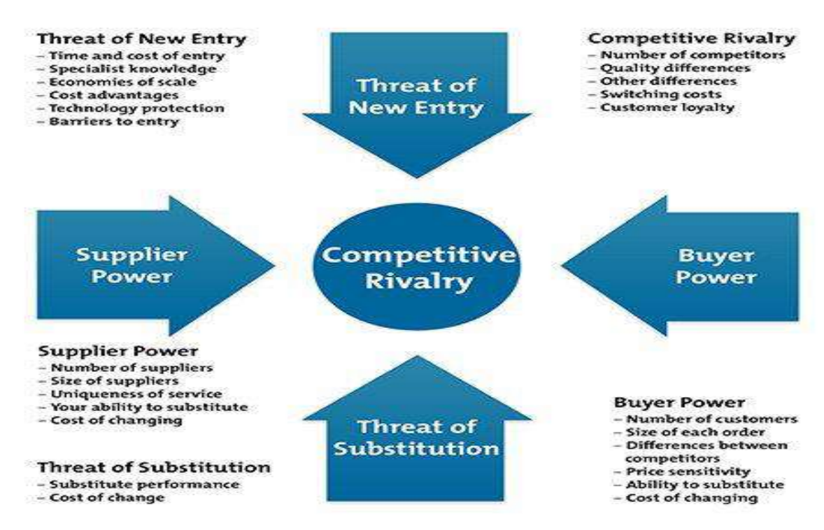
Figure 2: M. Porter Five Forces

According to the study, Malaysian market has rapidly grown and the Malaysian SMEs challenges are not limited and have to be studied constantly. In this article were given theoretical frameworks ( PESTLE), which SMEs suggested to use to identify its external barriers, which are faced on the first stage; and ( Porters' five Forces), which is suggested to use to identify strengths of the company and position in the targeted market.