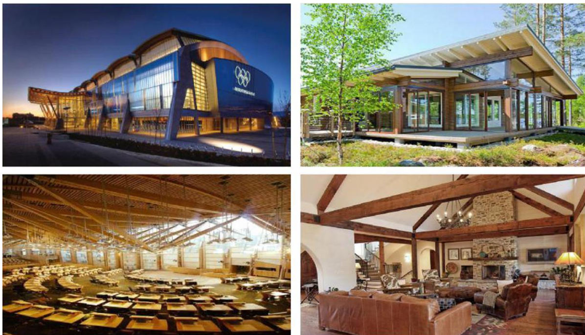
Figure 3: New type of timber structure

In recent years, China's Ministry of Housing and Urban-Rural Development has formulated and perfected a series of standards and norms related to timber structure architecture (Table 1), which has gradually formed a relatively complete technical system.