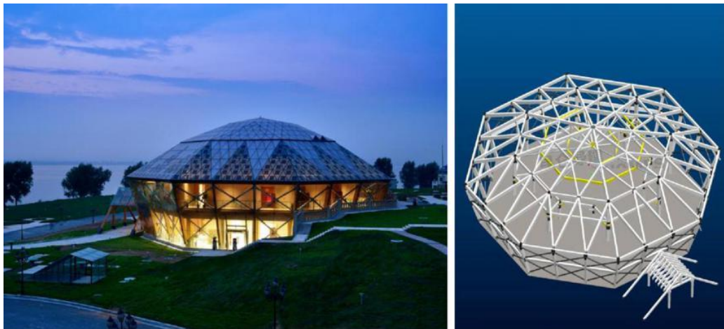
Figure 12: The diamond structure report hall

The project design is positioned in green and low carbon, low energy consumption and zero emission, cultural creativity, scientific and technological intelligence. It is established in high starting point planning and high standard construction. The park covers cultural products trading, film and television shooting, cultural exhibition, education training, new media, information service, ecological leisure and other fields. The first phase of the project covers 122667m 2 . The project is a green building and eco-city pilot project jointly built by the government of Changzhi city and the government of Singapore. It is the first industrial park integrating green ecology and creative culture in China.