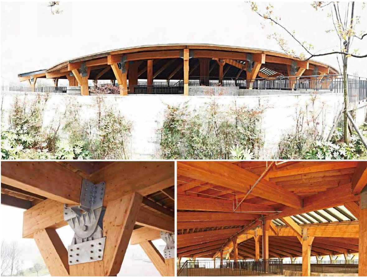
Figure 13: The eggshell-shaped structure