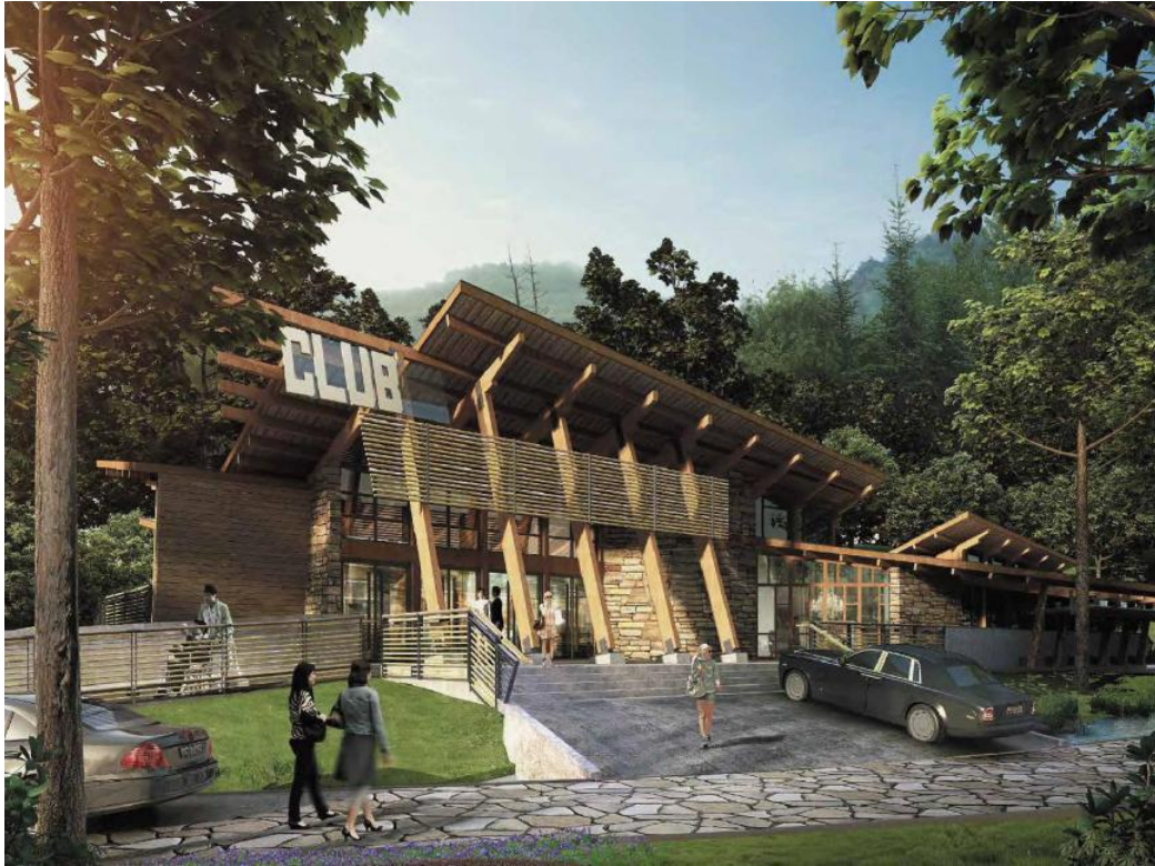
Figure 6: Heavy timber structure

and timbered bearing column of the ceiling are not hidden. Metope and the other part of the ceiling are usually filled up with the concrete, the rock, the glass window or other building materials (Figure 6).