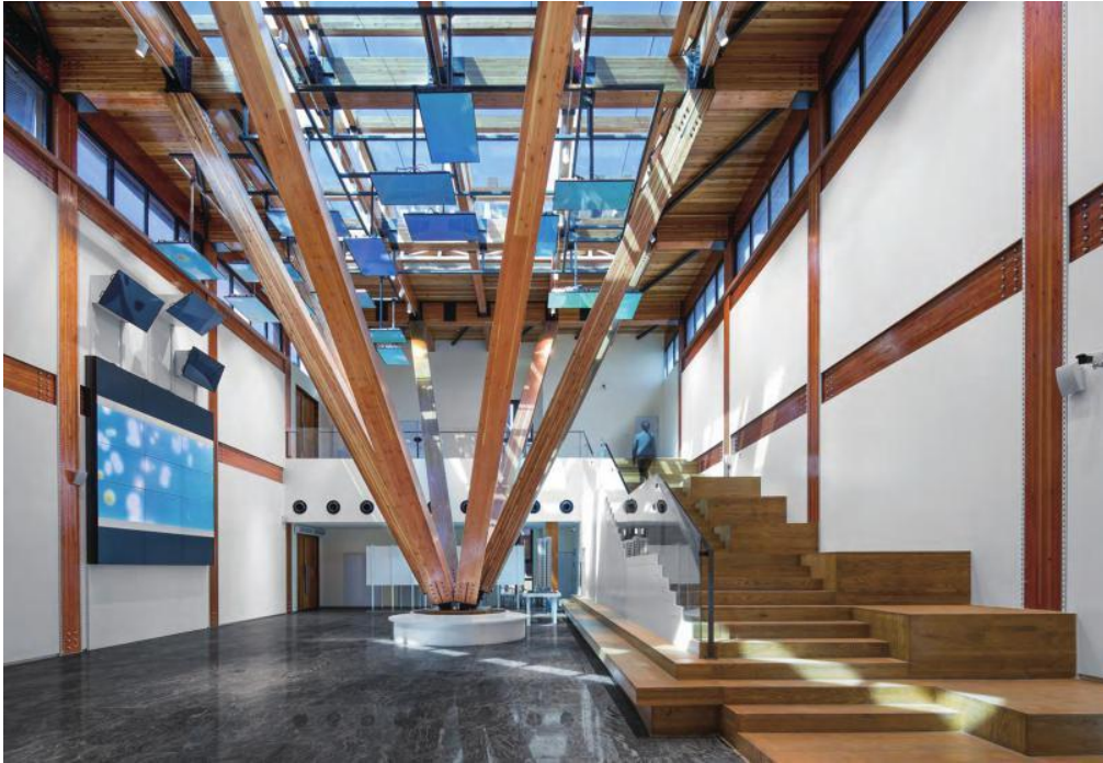
Figure 9: The umbrella timber structure

the second floor. The stair takes the transportation function already, also it is the rest place and showcase space. An umbrella timber structure is designed around the center of the space (Figure 9), and the six oblique columns diverge to the top and link the main and secondary beams of the roof, thus, a rectangular lighting skylight is made.