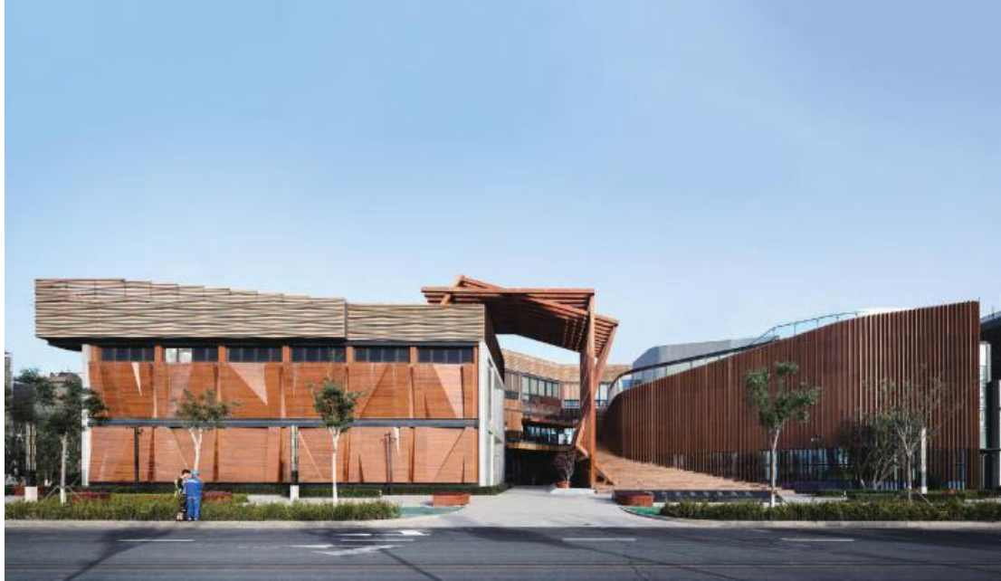
Figure 8: Exhibition center