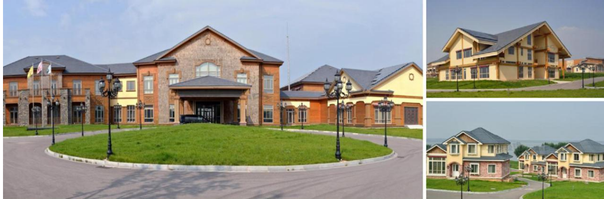
Figure 10, Figure 11: The recreation club