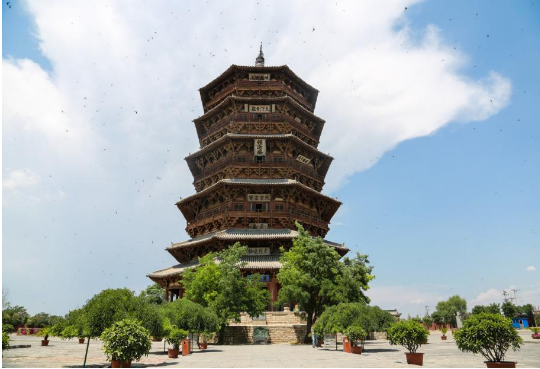
Figure 4: Yingxian Wooden Tower