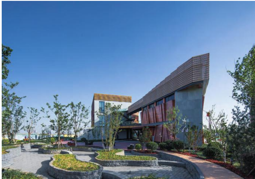
Figure 7: Main entrance of exhibition hall

Under the condition of covering an area of less than 5000 m 2 , according to owner's preliminary idea, three parts have been set up, namely, experience exhibition area, activity area and residential sales area. These three parts did separation according to the principle of form following function. After that, each volume is cut and rotated, and the main entrance and central courtyard of each direction are returned (Figure 7).