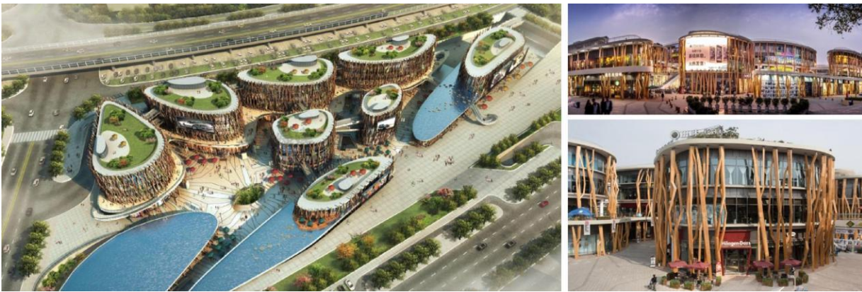
Figure 5: Heavy timber structure

Heavy timber structure refers to the large span beam structure which adopts the engineering timber products, the processed log or the log as bearing component. For the characteristics of exposure, it can fully embody the natural color of timber and beautiful decorative pattern (Figure 5).