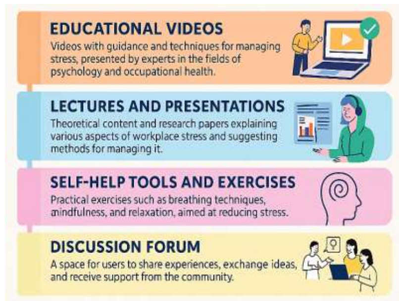
Figure 2: Interactive Learning Pathways for Reducing Stress at Work

individual-level adaptability—an essential capability for real-world deployment in dynamic occupational environments.