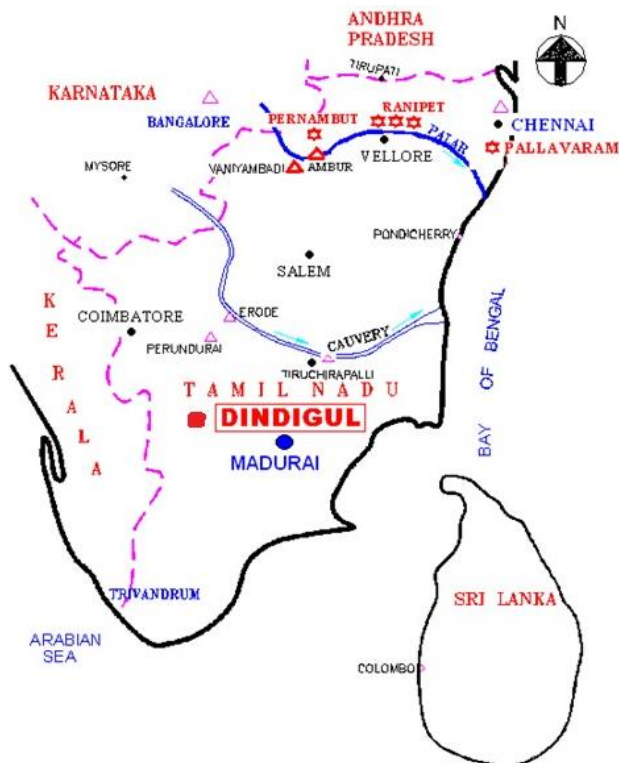
Figure 1: Study Area

The objectives of the study is to isolate the chromium tolerant bacterial strains from the tannery effluent, and to measure minimum inhibitory concentration of six bacterial strains that can be used for bioremediation process.