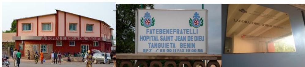
Figure 1: Hospital Entrance and Laboratory Entrance

At the Histopathology Laboratoy of Saint John of God Hospital in Tanguieta – Benin ( Figure 1 ), after three years of activity and about 500-600 cases analyzed a diagnostic critical point has emerged.