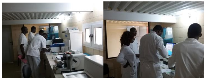
Figure 5: Training of Local Technical Personnel in the Application of Immunohistochemistry