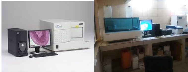
Figure 7: Telepathology Station and Immunohistochemistry Station

This is the first and only Laboratory of West Africa with complete and automated systems for telepathology and immunochemistry. (Figure 7)