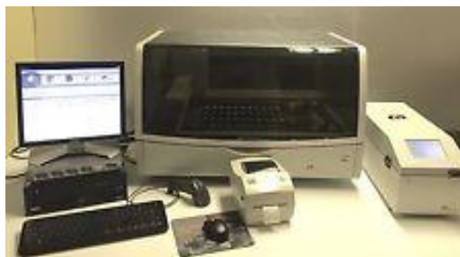
Figure 4: Complete Station Autostainer 480S - Thermo Scientific

instrument and antibodies were purchased with funds from the UTA Onlus organization and the Bio-Optica company.