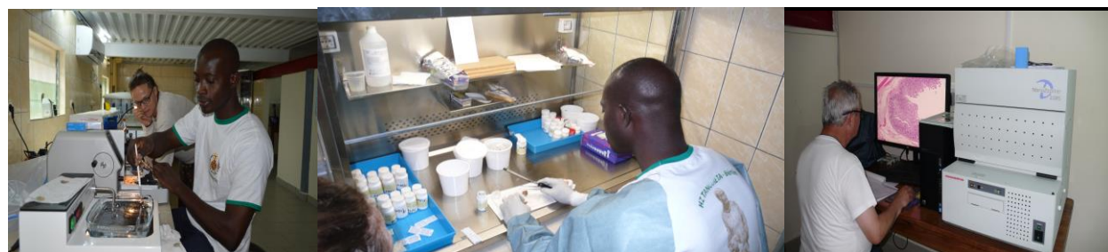
Figure 3: Training Of Local Technical Personnel in Histological Techniques and Preparation of Telepathology

After completing the laboratory, we have trained the staff (Figure 3).