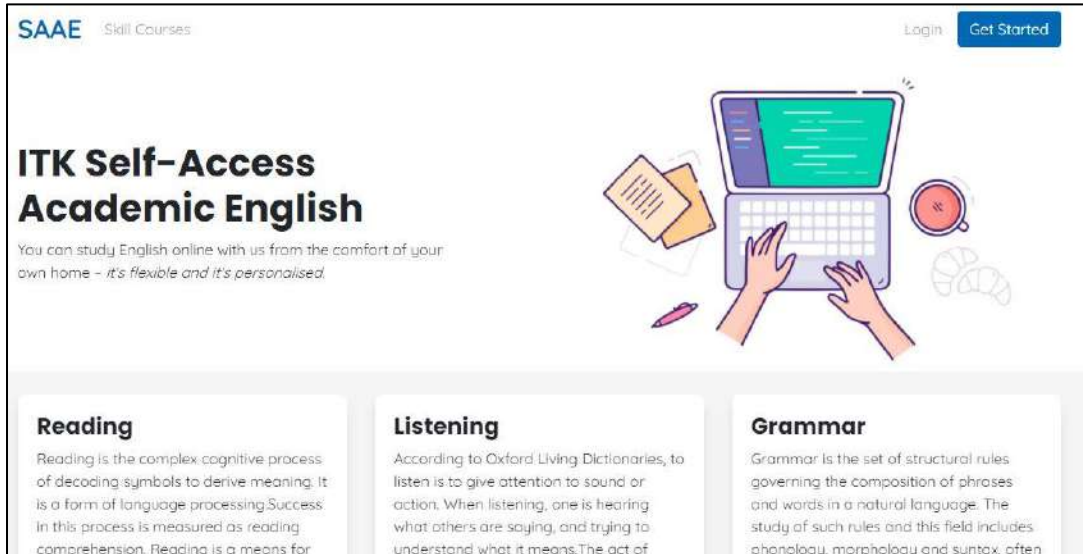
Figure 2: The front page of SAAE website

laptop/PC. The prototype is by no means the final product of this web-based material for a website will be improved from time to time.