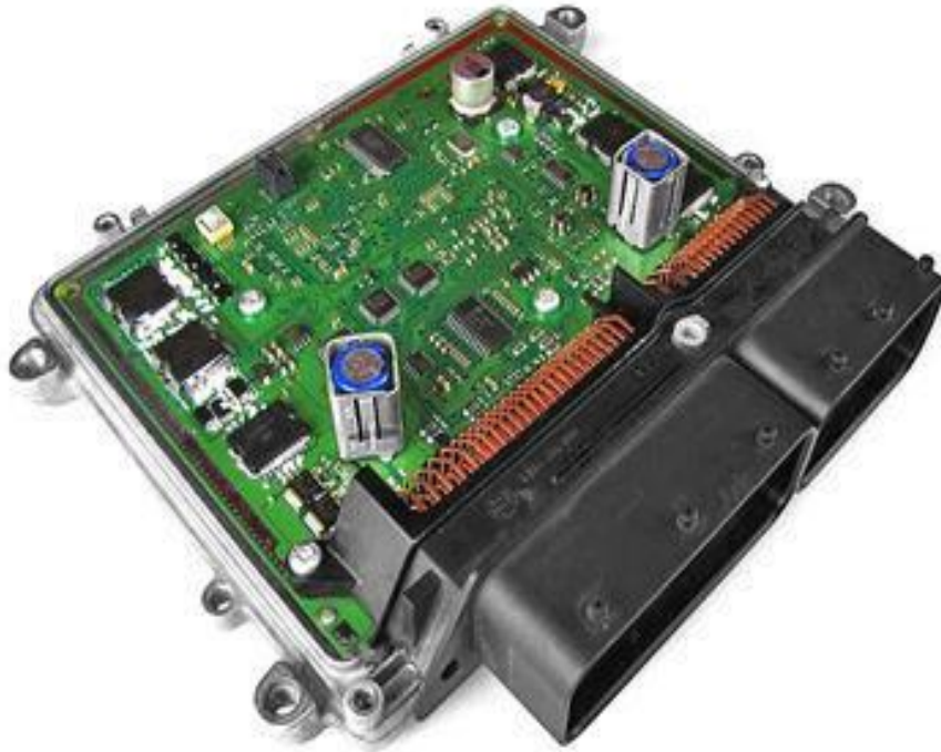
Figure 1: Car Electronic Control Unit (ECU)